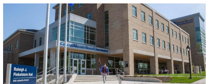
Raleigh J. Finkelstein Hall (RFH)