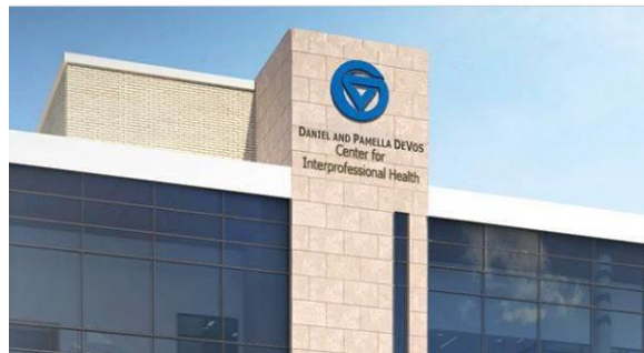
Daniel and Pamela DeVos Center for Interprofessional Health (DCIH)

Click on the images for maps and directions