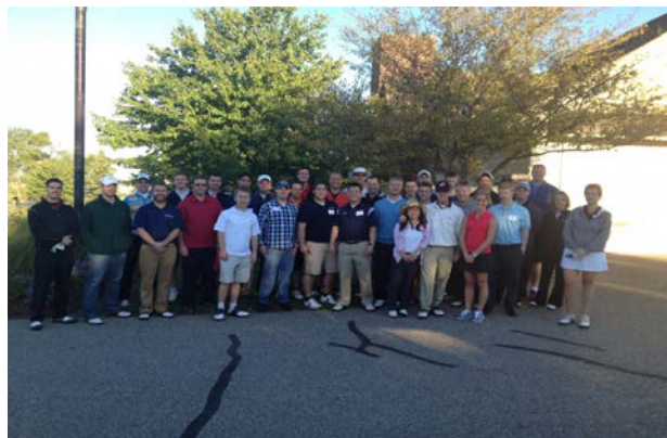
IPO Students Fall 2012