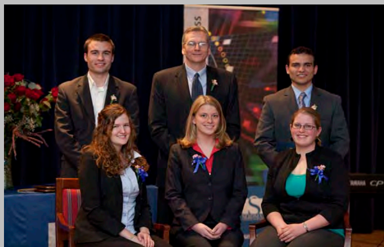
Some of the outstanding Seidman College of Business Majors for 2010

Every year, the Seidman College of Business recognizes outstanding senior level business students in each of the eight majors. As in past years, the students were recognized at an annual Seidman Recognition Dinner and the All-University Honors Banquet.