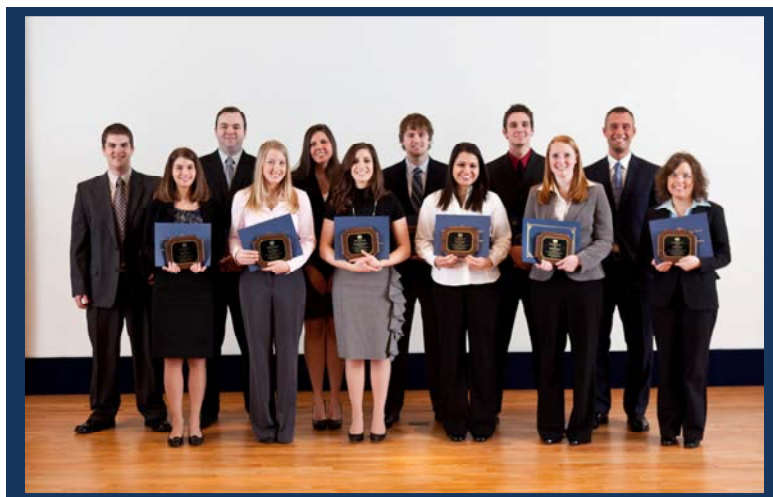
Outstanding Seidman College of Business Majors for 2011