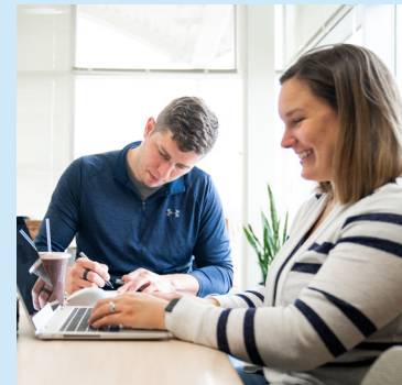
Expanded entrepreneur office space.