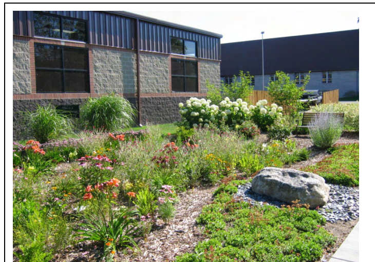
The Village of Spring Lake's rain garden provides rainwater and runoff infiltration, and it beautifies the lot (July 2008)