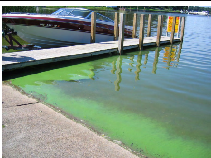
Algae bloom in Spring Lake at the Fruitport Boat Launch (July 2008).

http://www.gvsu.edu/wri/waterqualitysurvey