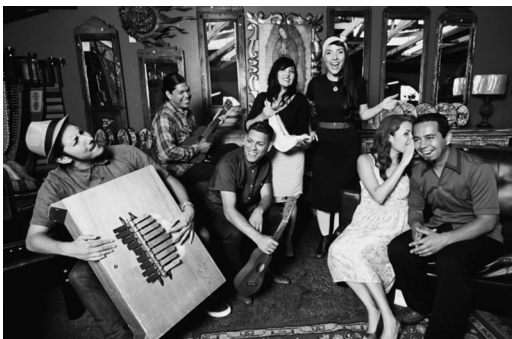
Las Cafeteras will perform on campus October 27 in the Kirkhof Center.