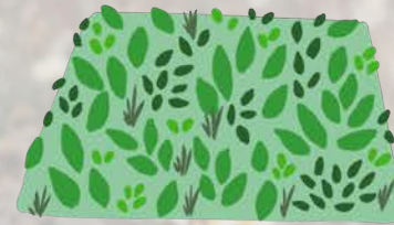
1 m 2 control plot