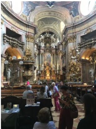
The baroque splendor of the Peterskirche (St. Peter's Church)

Music is central to Viennese identity: on any day of the week, there are multiple choices for high-quality, affordable performances of orchestral, solo, and chamber music. Several theaters feature spoken and musical drama and ballet. Our group will attend some performances together, and students will be able to select others that match their interests. We will take a weekend trip to the beautiful city of Innsbruck in the Austrian Alps, once the capital of the Holy Roman Empire.