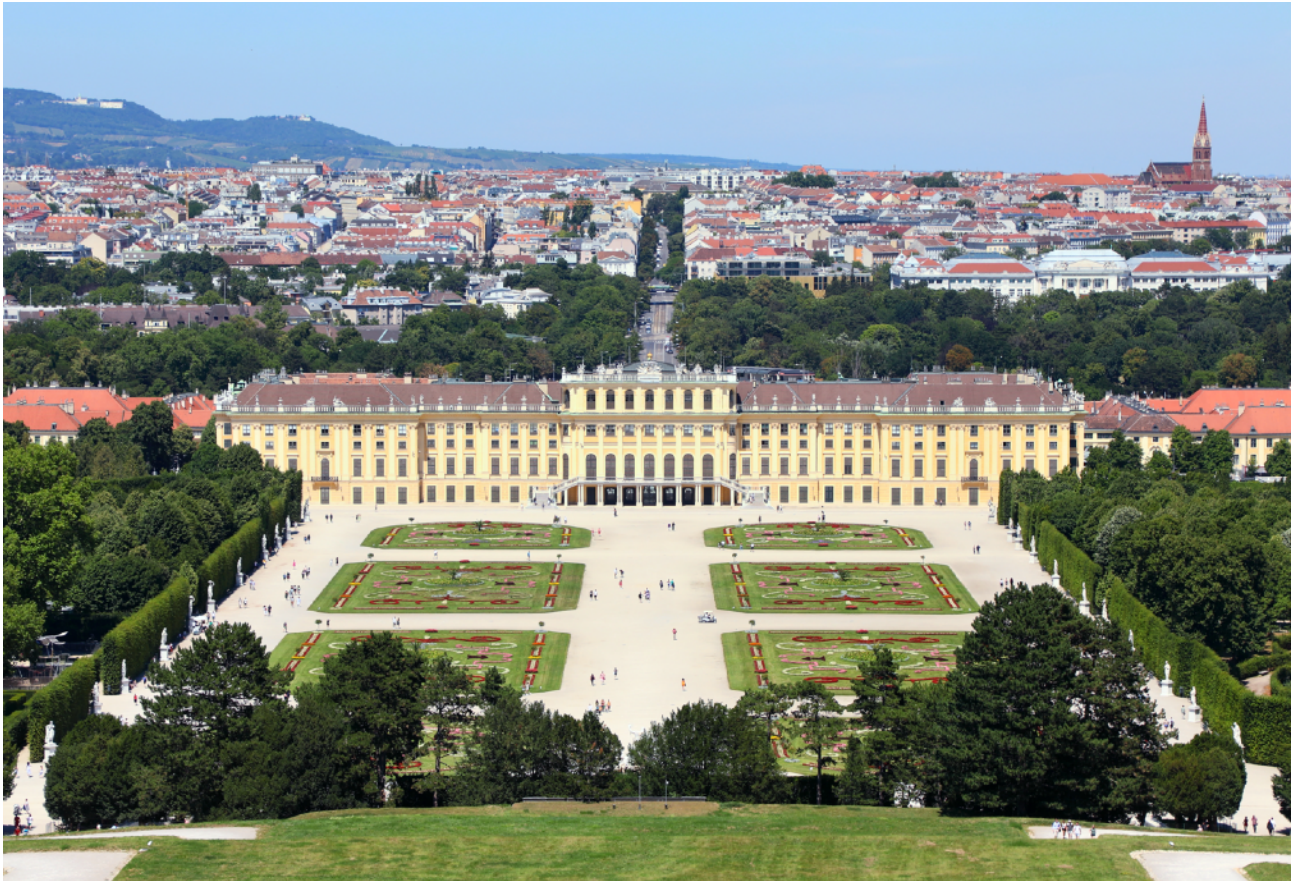
Schönbrunn Palace