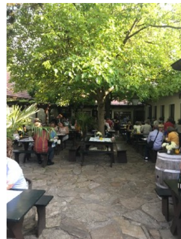
Outdoor dining among the vineyards, at one of Vienna's legendary Heurigen (winery restaurants)