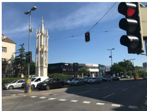
The old and the new. The Spinnerin am Kreuz, dating back to at least the 15th century, still proudly welcomes travelers to Vienna from the south on the Triesterstrasse, despite being surrounded by very modern car dealerships.