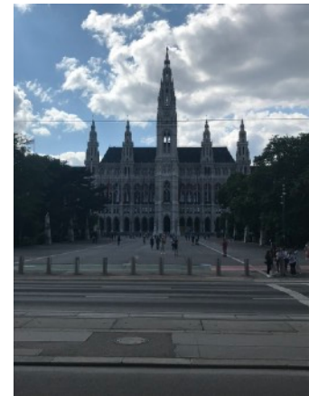
The Rathaus (City Hall)