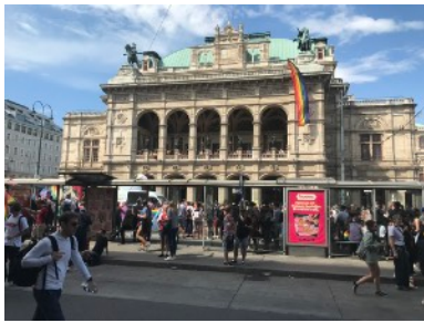
The Staatsoper (Opera House)

Music is central to Viennese identity: on any day of the week, there are multiple choices for high-quality, affordable performances of orchestral, solo, and chamber music. Several theaters feature spoken and musical drama and ballet. Our group will attend some performances together, and students will be able to select others that match their interests. We will take a weekend trip to the beautiful city of Innsbruck in the Austrian Alps, once the capital of the Holy Roman Empire.