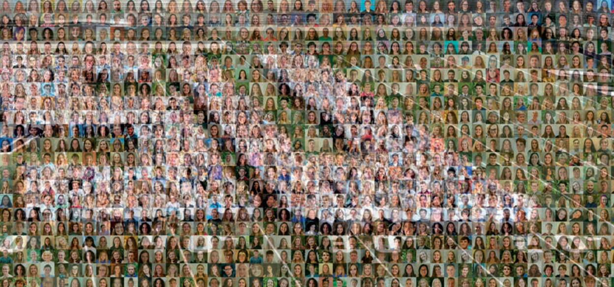
Freshman class, Fall 2020