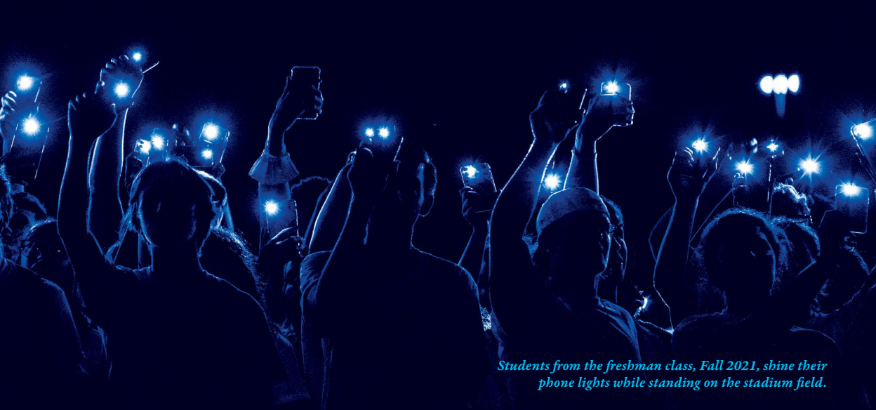
Students from the freshman class, Fall 2021, shine their phone lights while standing on the stadium field.