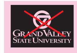
example of pink paper